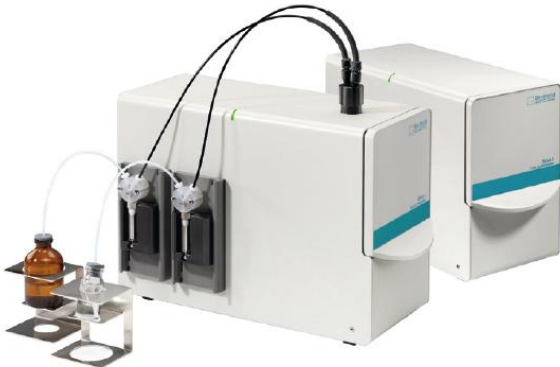
new! Sirius L Tube Luminometer