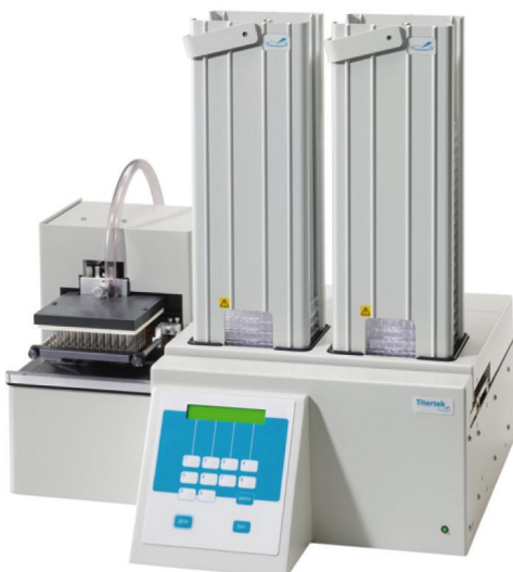
new! Zoom HT Microplate Washer

Complete assay automation in one compact instrument